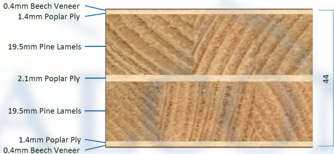
Fig. 2 – Cross section through Type B door blank design

The doorset design incorporates glazing, hardware, intumescent seals and non-intumescent seals (i.e. smoke and weather seals).