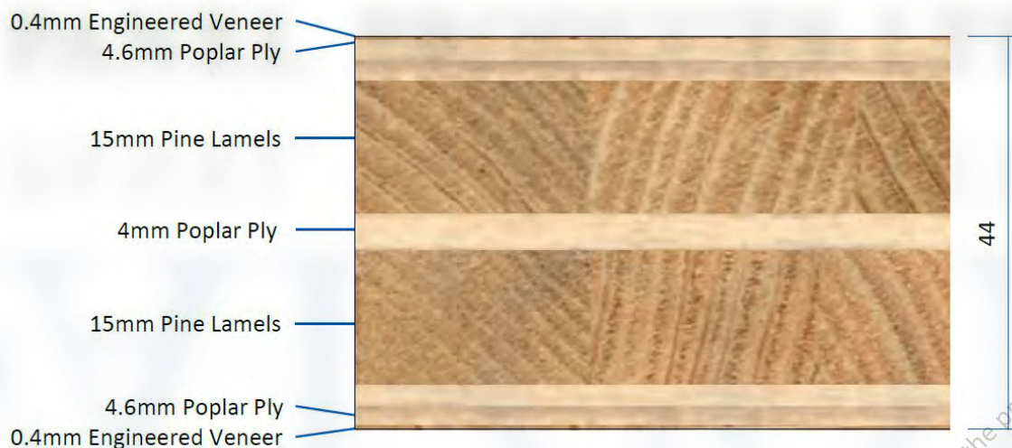
Fig. 1 – Cross section through Type A door blank design