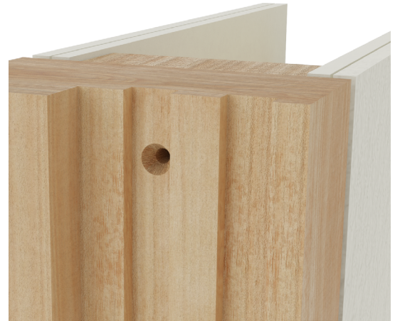
Counter bored pilot hole in intumescent seal groove

If the fixings are to be concealed by an intumescent strip, the counter bored cavity only needs to be as deep as a screw head. If the fixings are not concealed, allow a deeper counter bored cavity so that a timber plug can be fitted over the screw head.