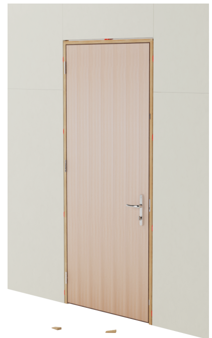
Leaf operation tested and gaps checked