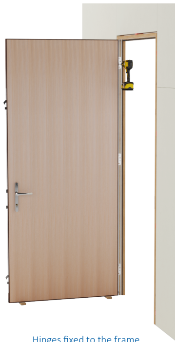
Hinges fixed to the frame