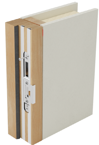
Multi-point lock style keep fitted to frame

Ensure that the correct and compatible fixing screws have been used.