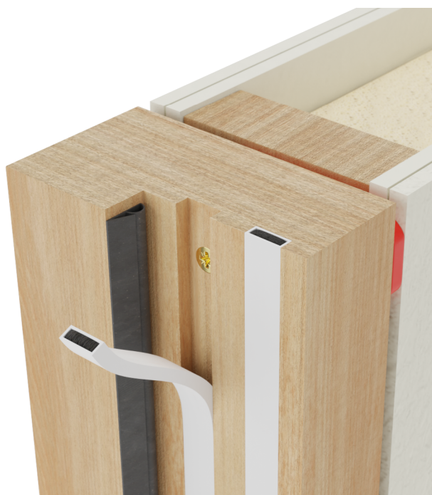
Intumescent and smoke/acoustic seals being fitted to the frame

A Stredor CE Marked doorset will usually be supplied with seals installed, however the seals may be supplied loose or temporarily removed for the purpose of installation fixing and finishing.