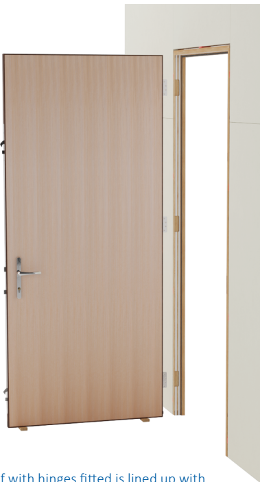
Leaf with hinges fitted is lined up with hinge recesses in frame using wedges

Release the drop seal and ensure that it is operating correctly, and drops enough to make contact with any threshold or final floor covering. Ensure that any smoke or acoustic seals make a good contact with the door leaf.